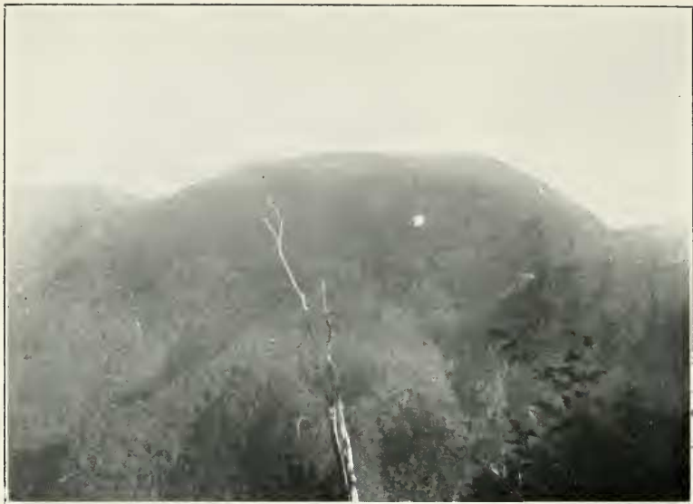
NEAR BASE OF PIC DE MACAYA. From Desbarriere, Haiti, April 11, 1931.